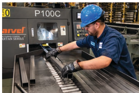
Continuous feeding of bar and tube stock possible with automated loading table