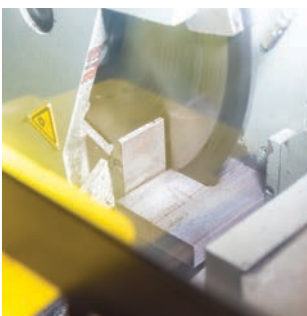
Ultra thin carbide blades minimize kerf loss and material waste