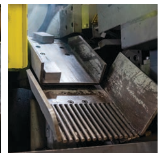
Automatic, hydraulic discharge chute sorts finished pieces